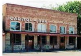
Capitol Bar, Socorro

Over 300 businesses have reached out for assistance through the program