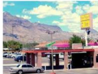
San Miguel Inn, Socorro